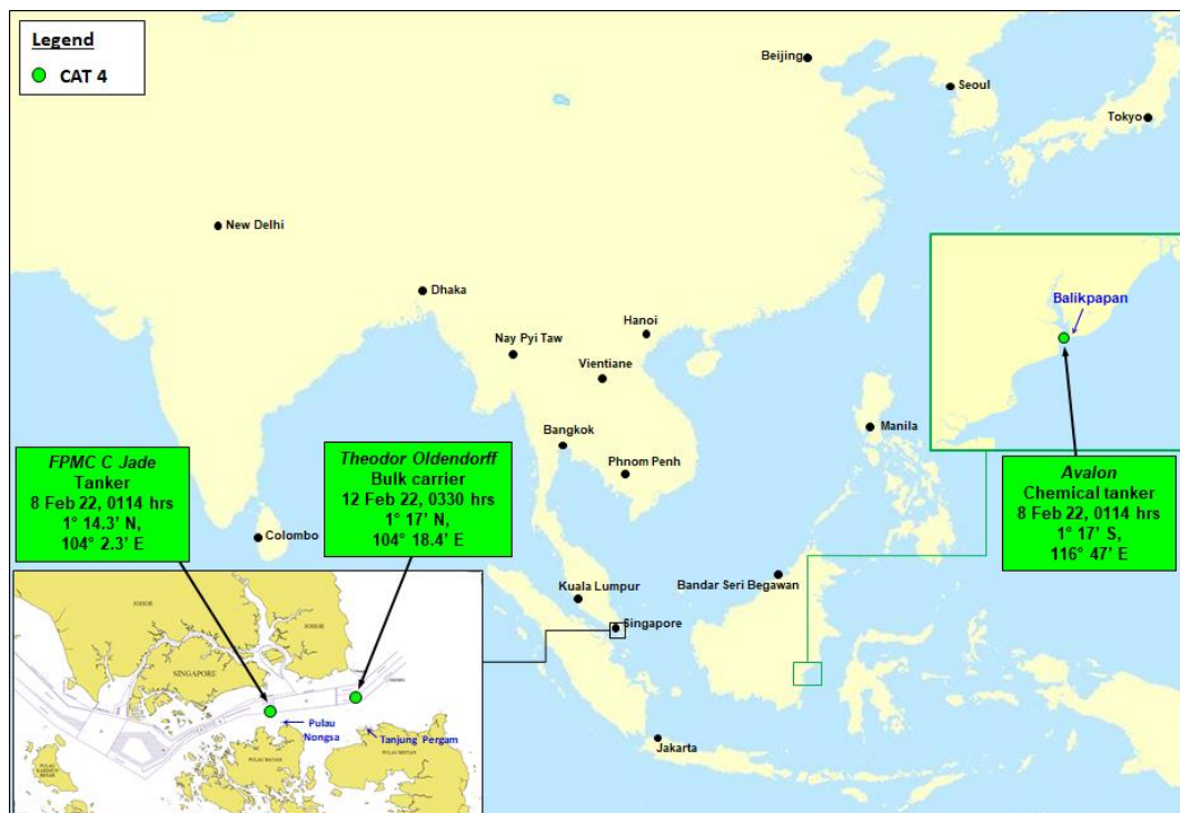
Location of incidents