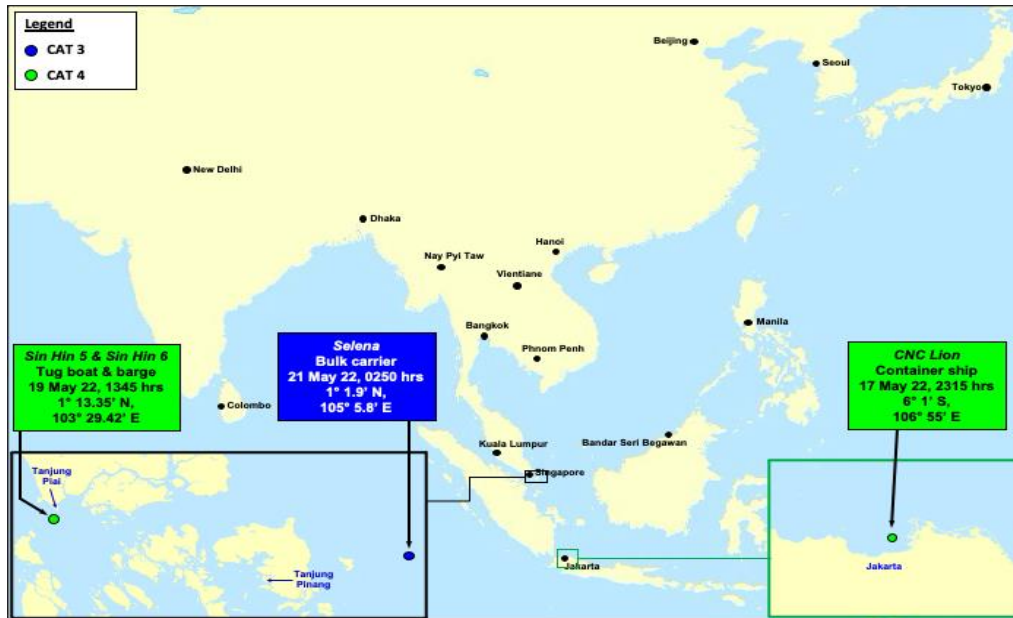
Location of incidents

The locations of the three incidents are shown in map below and detailed description of the incidents tabulated in the attachment.