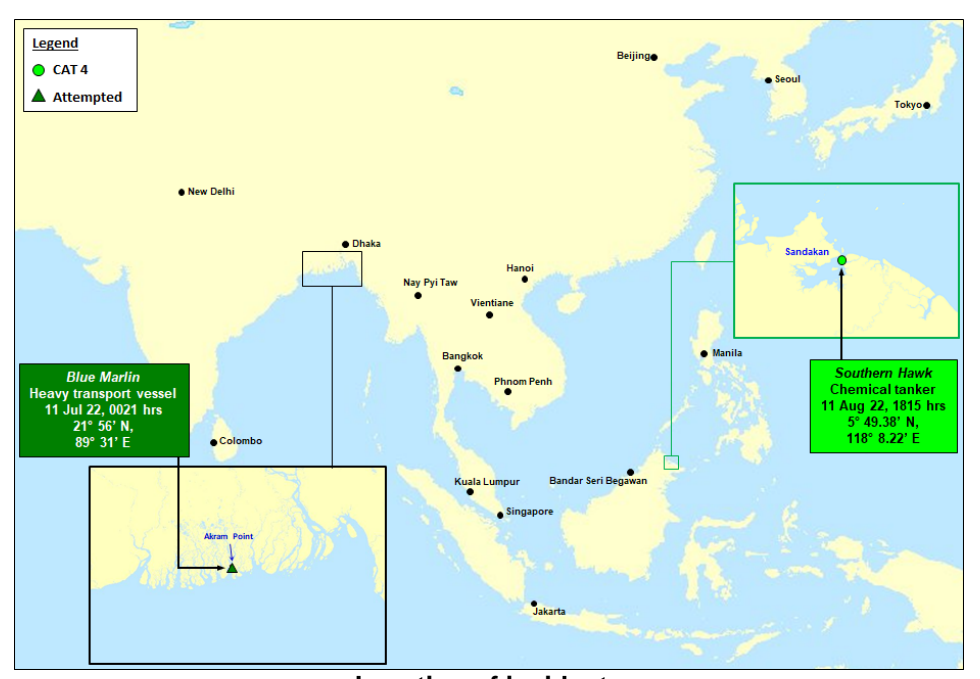
Location of incidents

The locations of the two incidents are shown in map below, and detailed description of the incidents tabulated in the attachment.