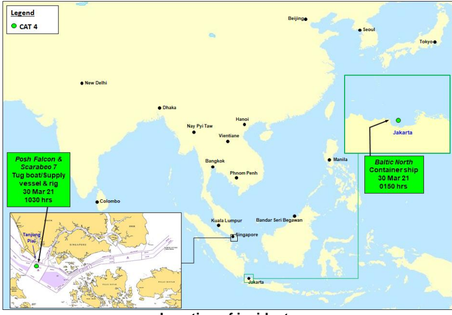
Location of incidents

The location of the two incidents are shown in the map below; and detailed description of the incidents tabulated in the attachment.