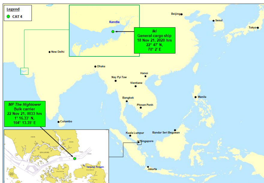
Location of incidents

The location of the incidents is shown in the map below, and detailed description of the incidents is tabulated in the attachment.