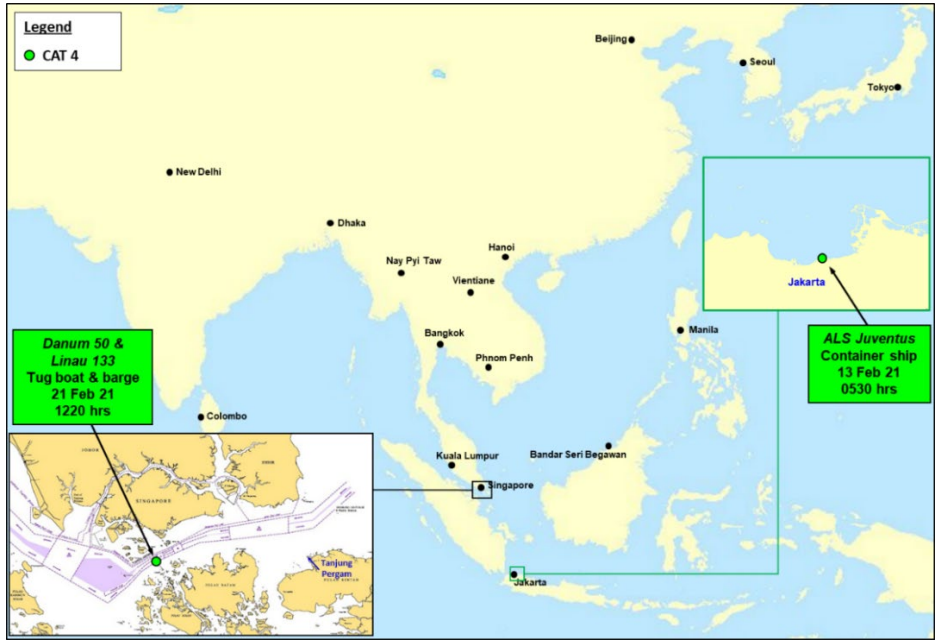
Location of the incidents

The locations of two incidents are shown in the map below; and detailed description of the incidents tabulated in the attachment.