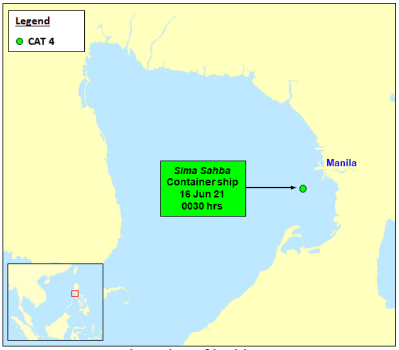
Location of incident

The location of the incident is shown in the map below, and detailed description of the incident is tabulated in the attachment.