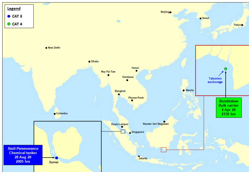
Location of incidents

The location of the incidents is shown in the map below; and detailed description of the incidents tabulated in the attachment.