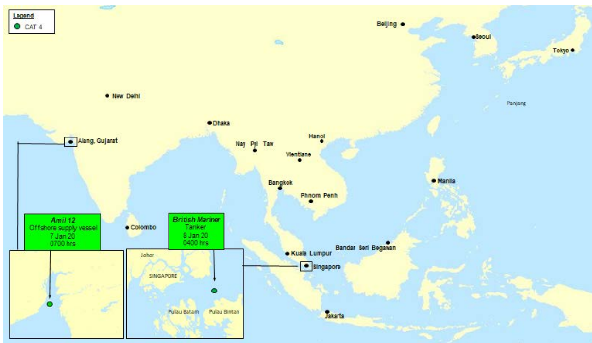
Location of the incidents

During 7-13 Jan 19, two CAT 4 1 incidents of armed robbery against ships were reported to ReCAAP ISC. One incident occurred to a ship while anchored at Alang Anchorage, India; and one incident occurred to a ship while underway in the eastbound lane of the Traffic Separation Scheme (TSS) in the Singapore Strait. The location of the incidents is shown in the map below; and detailed description tabulated in the attachment.