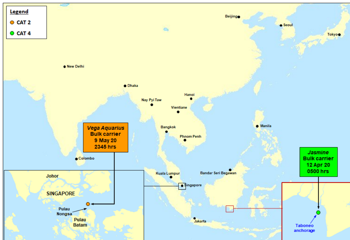
Location of incidents

The location of the incidents is shown in the map below; and detailed description of the incidents tabulated in the attachment.