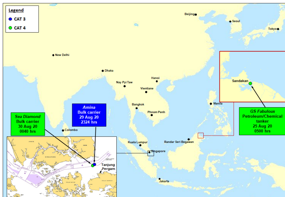
Location of incidents

The location of the incidents is shown in the map below; and detailed description of the incidents tabulated in the attachment.