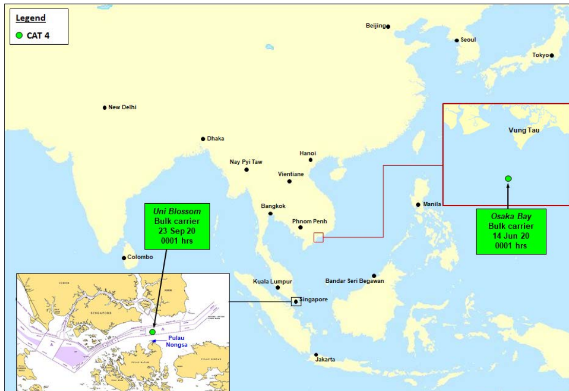
Location of incidents

The location of the two incidents is shown in the map below; and detailed description of the incidents tabulated in the attachment.