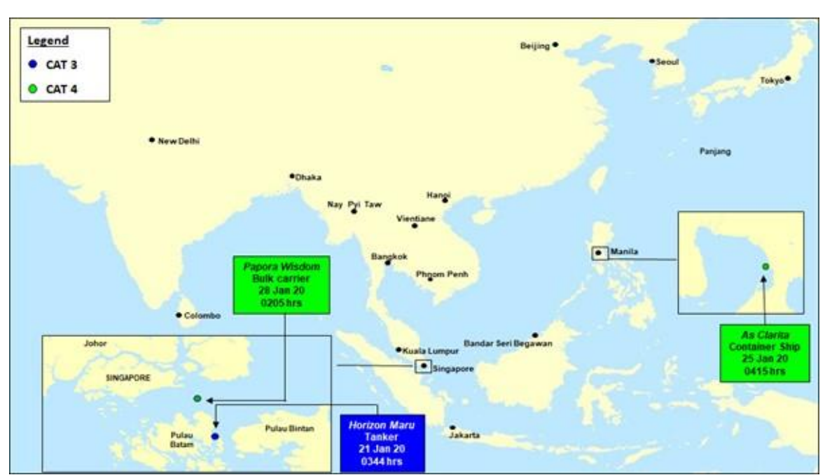
Location of the incidents

The CAT 3 incident occurred to a tanker while anchored off Port Kabil, east of Pulau Batam, Indonesia. One of the CAT 4 incidents occurred to a bulk carrier while underway in the eastbound lane of the Traffic Separation Scheme (TSS) in the Singapore Strait. The other CAT 4 incident occurred to a container ship while anchored at South Quarantine Anchorage area, Manila, Philippines. The location of the three incidents is shown in the map below; and detailed description tabulated in the attachment.