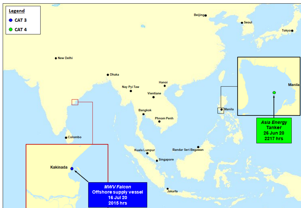
Location of incidents

The location of the incidents is shown in the map below; and detailed description of the incidents tabulated in the attachment.