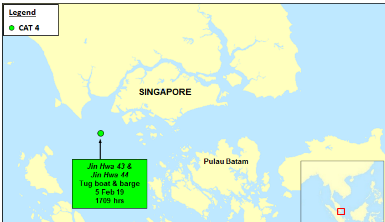
Location of incident

During 5-11 Mar 19, an incident of armed robbery against ship was reported to ReCAAP ISC. The incident occurred on 5 Feb 19 and was reported to ReCAAP ISC by Focal Point Singapore after verification with the relevant agencies. The location of the incident is shown in the map below; and detailed description of the incident is tabulated in attachment.