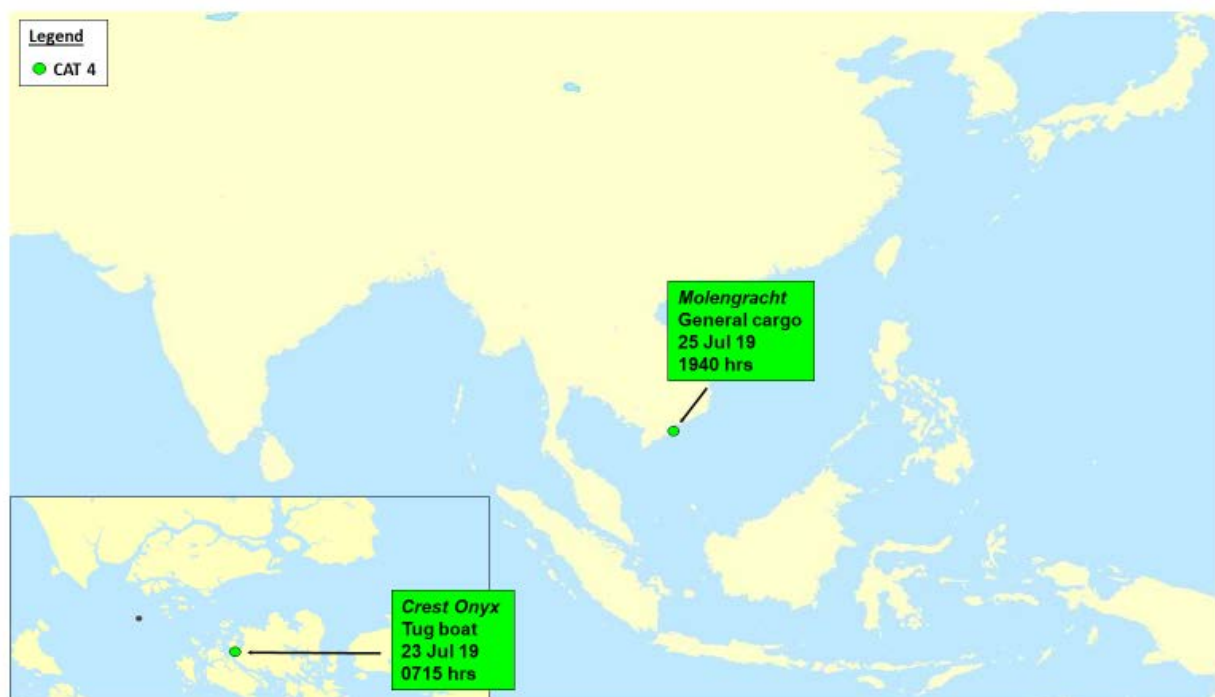
Location of the Incidents

During 30 Jul - 05 Aug 19, two Category 4 1 incidents of armed robbery against ship were reported to the ReCAAP ISC. One incident occurred to a tug boat at PT Darma Sentosa Marindo Yard, Batam Island Indonesia on 23 Jul 19. The other incident involved a general cargo ship at Lotus Port, Phu My Bridge, Ho Chi Minh, Vietnam on 25 Jul 19. Both incidents occurred while the ships are at berth. The location of the incidents is shown in the map below, and description tabulated in the attachment.