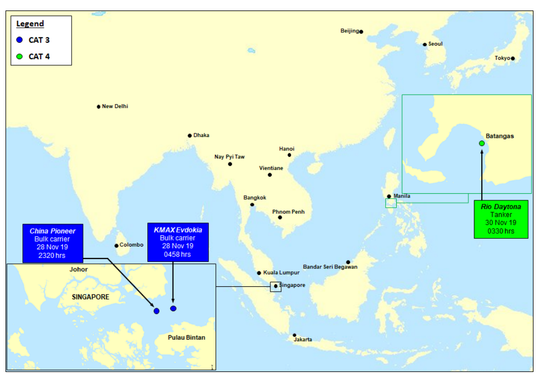
Location of the incidents

During 26 Nov - 2 Dec 19, three incidents of armed robbery against ships in Asia were reported to ReCAAP ISC by ReCAAP Focal Points. Two were CAT 3^1 incidents that occurred to ships while underway in the eastbound lane of the Singapore Strait; and one was a CAT 4^2 incident while the ship was at anchor in Batangas, Philippines. The location of the incidents is shown in the map below; and detailed description is tabulated in the attachment.