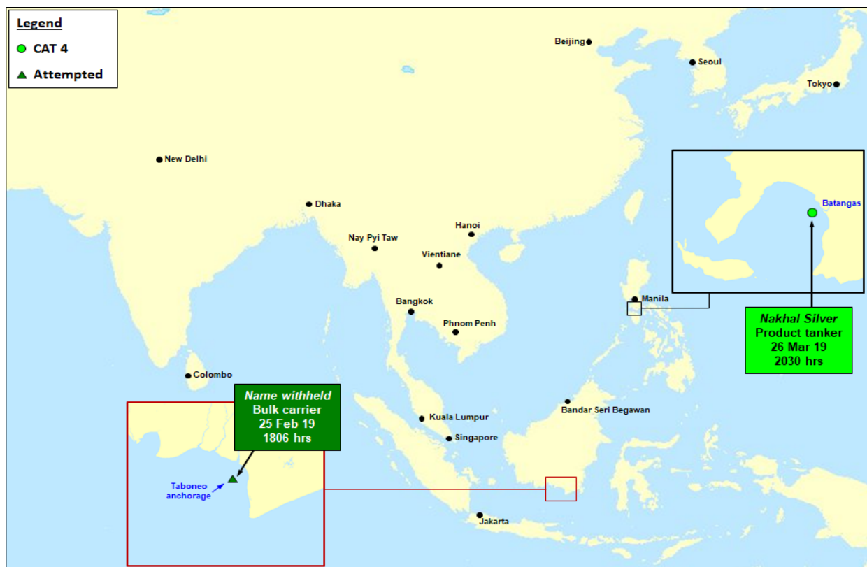
Location of incidents

The location of the incidents is shown in the map below; and detailed description of the incidents is tabulated in attachment.