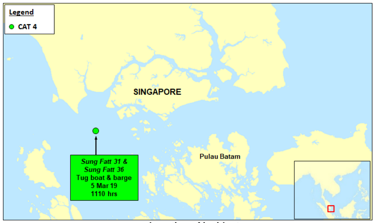
Location of incident

During 26 Feb- 4 Mar 19, an incident of armed robbery against ship was reported to ReCAAP ISC. The location of the incident is shown in the map below; and detailed description of the incident is tabulated in attachment.