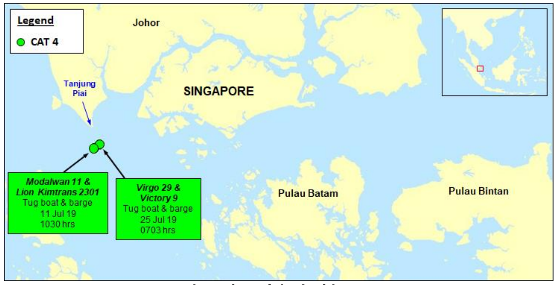
Location of the Incidents

During 23 – 29 Jul 19, two CAT 4<sup>1</sup> incidents of armed robbery against ship were reported to the ReCAAP ISC. Both incidents occurred to tug boats towing barges while underway in the westbound lane of the Traffic Separation Scheme (TSS) in the Singapore Strait. The incidents occurred on 11 Jul 19 and 25 Jul 19 in the western sector of the Singapore Strait. The location of the incidents is shown in the map below, and description tabulated in the attachment.