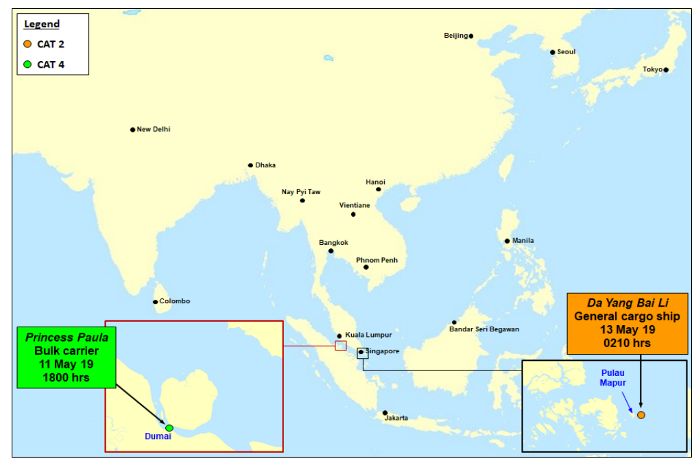
Location of incidents

During 21-27 May 19, one Category 2<sup>1</sup> incident and one Category 4<sup>2</sup> incident of armed robbery against ships in Asia were reported to ReCAAP ISC. This is the first Category 2 incident reported in 2019 which involved the crew being held hostage by perpetrators armed with knives; and cash and personal effects of the crew were stolen. Both incidents occurred in Indonesia. Category 2 incident occurred approximately 4 nm east of Pulau Mapur on 13 May 19 and Category 4 incident occurred at Lubuk Gaung anchorage in Dumai on11 May 19. The location of the incidents is shown in the map below; and detailed descriptions are tabulated in attachment.