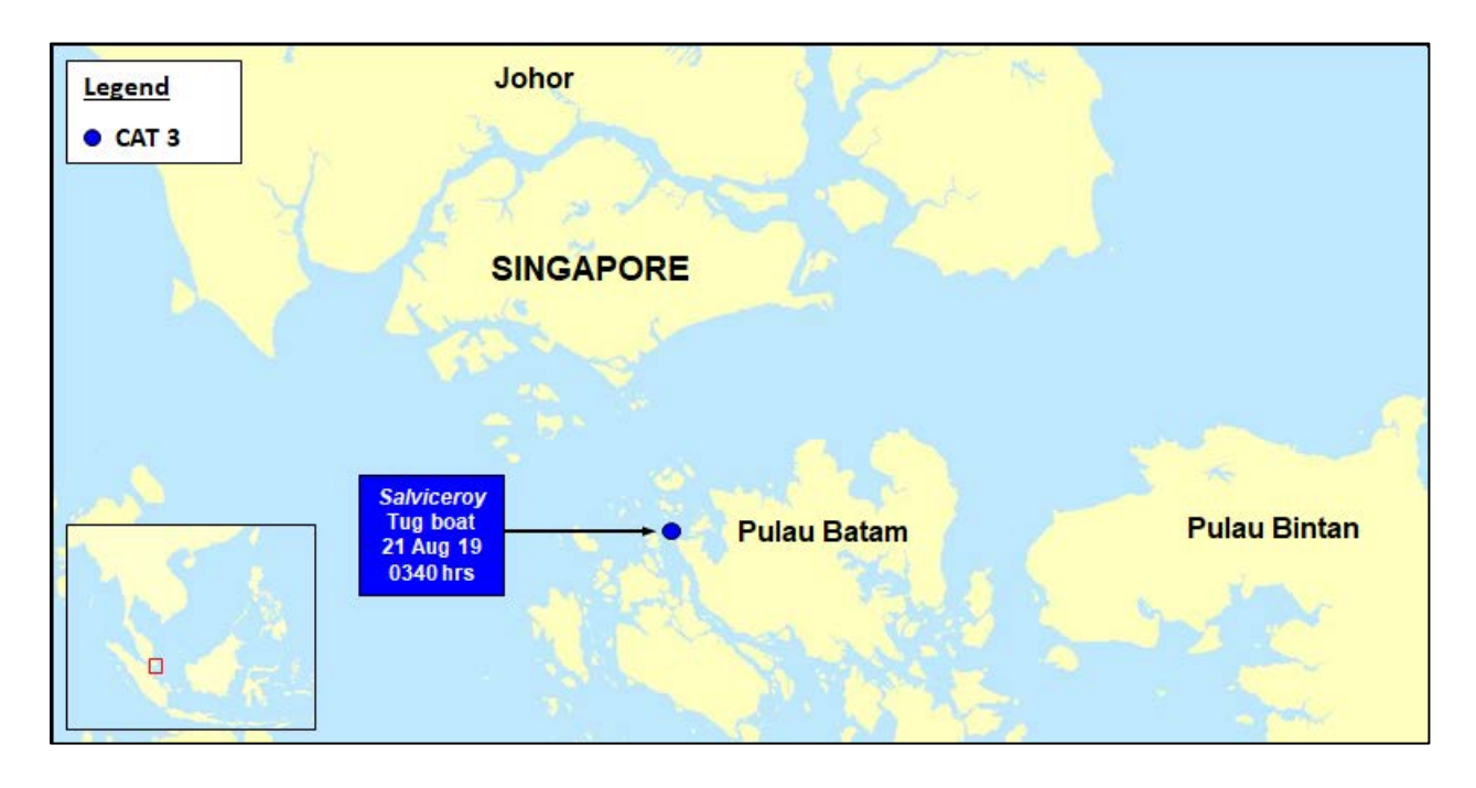
Location of the Incident

Refer to map below for the location of the incident. The detailed description of the incident is tabulated in the attachment.