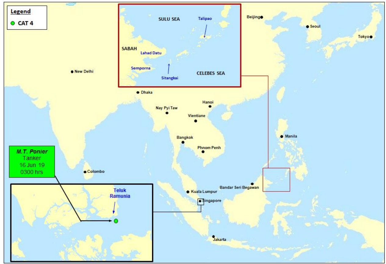
Location of incidents