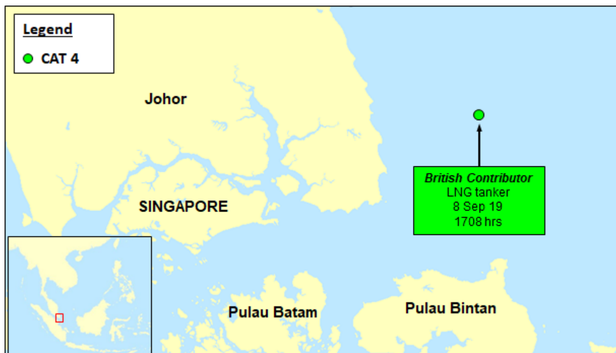
Location of the Incident

Refer to the map below on the location of the incident. The details are in the attachment.