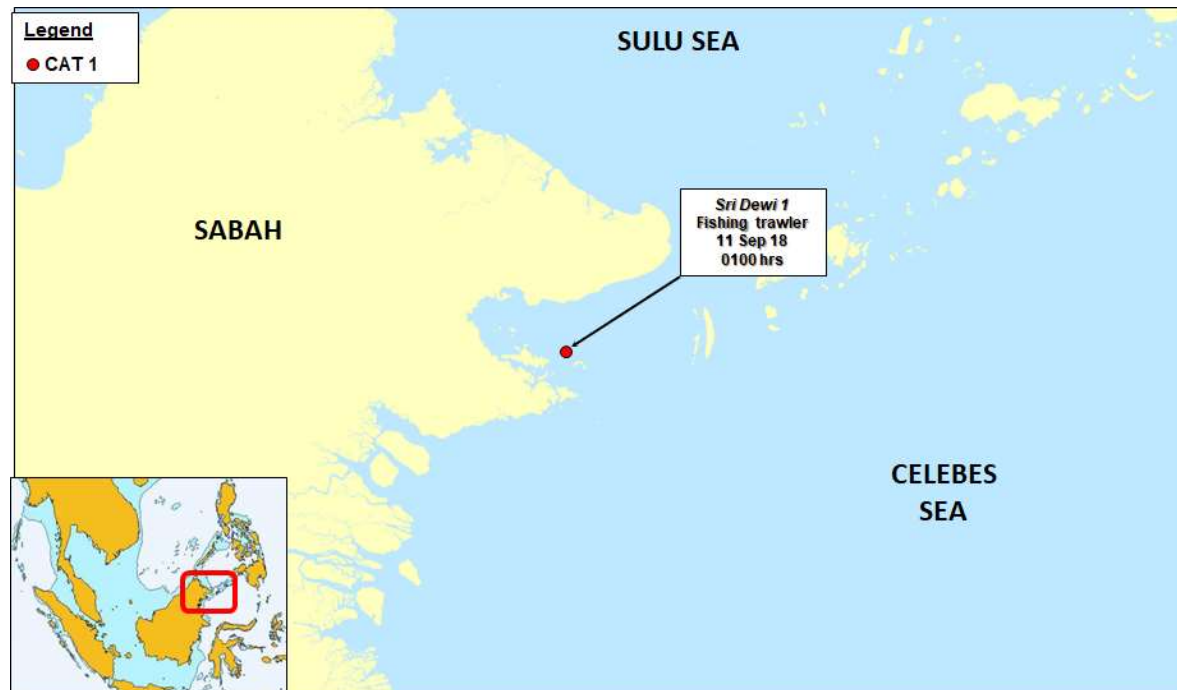
Location of incident

During 11-17 Sep 18, one incident of abduction of crew of fishing trawler, Sri Dewi 1 was reported to ReCAAP ISC. The location of the incident is shown in the map below; and detailed description of the incident is tabulated in attachment.