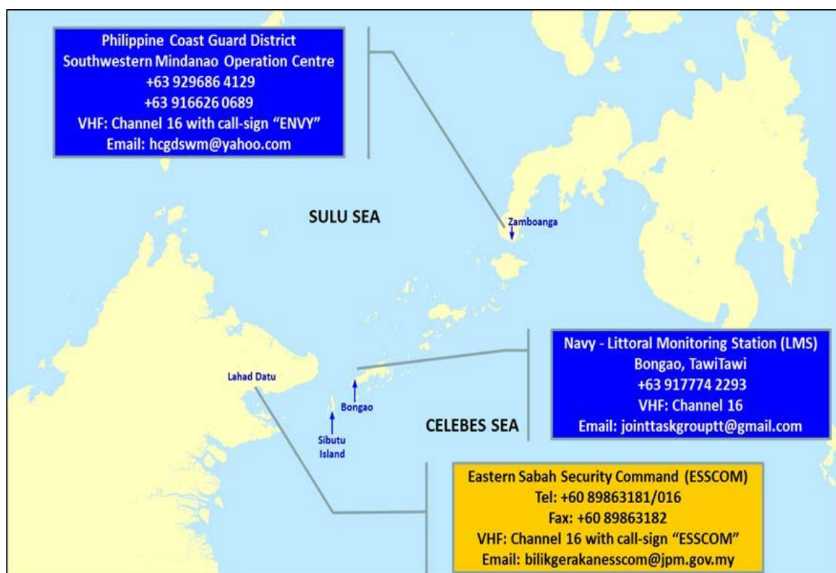
Contact details of the reporting centres

The last actual incident of abduction of crew in the Sulu-Celebs Seas occurred on 23 Mar 17 and the last attempted incident on 16 Feb 18. However, as the threat of abduction of crew in the Sulu-Celebes Seas is not eliminated, ReCAAP ISC maintains its advisory issued via the ReCAAP ISC Incident Alert dated 21 November 2016 to all ships to reroute from the area, where possible. Otherwise, ship masters and crew are strongly urged to exercise extra vigilance while transiting the Sulu-Celebes Seas and eastern Sabah region, and report immediately to the following Centres: