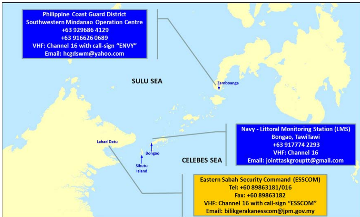
Contact details of the reporting centres

The ReCAAP ISC reiterates its advisory issued via the ReCAAP ISC Incident Alert dated 21 November 2016 to all ships to re-route from the area, where possible. Otherwise, ship masters and crew are strongly urged to exercise extra vigilance while transiting the Sulu-Celebes Sea and eastern Sabah region, and report immediately to the following Centres: