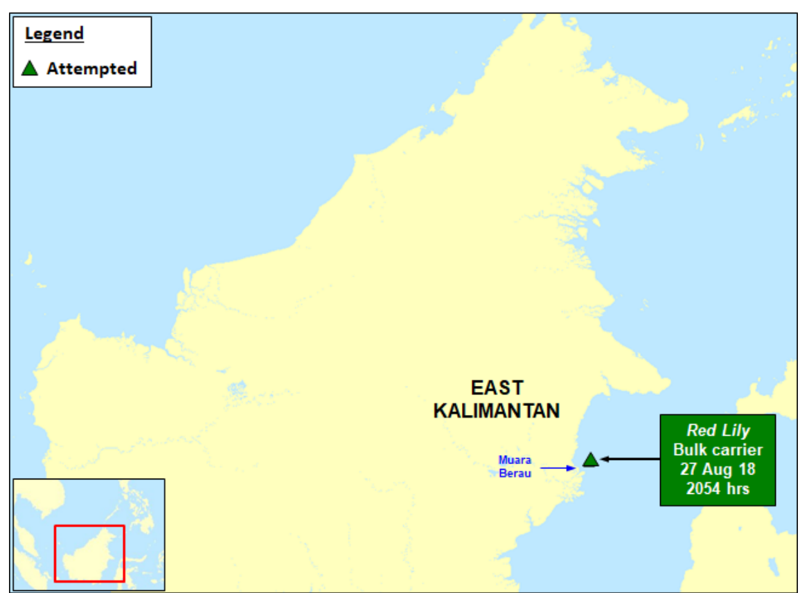
Location of incident

During 4-10 Sep 18, one attempted incident of armed robbery against ships was reported to the ReCAAP ISC. The location of the incident is shown in the map below; and detailed description of the incident is tabulated in attachment.