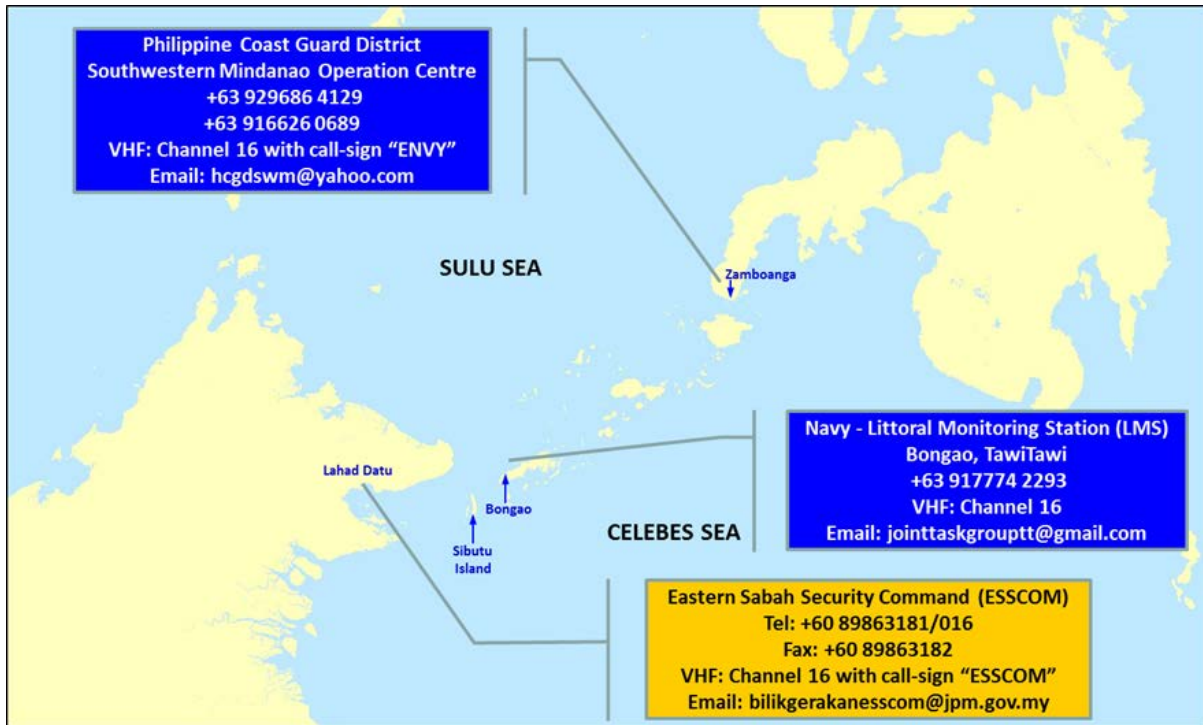
Contact details of the reporting centres

The ReCAAP ISC reiterates its advisory issued via the ReCAAP ISC Incident Alert dated 21 November 2016 to all ships to re-route from the area, where possible. Otherwise, ship masters and crew are strongly urged to exercise extra vigilance while transiting the Sulu-Celebes Sea and eastern Sabah region, and report immediately to the following Centres: