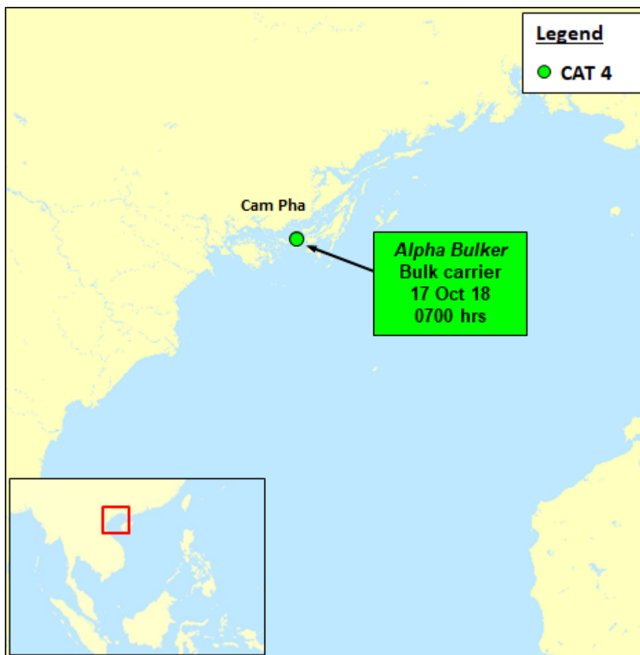
Location of incident

During 27 Nov - 3 Dec 18, one incident of armed robbery against ship was reported to ReCAAP ISC after verification by Focal Point. The location of the incident is shown in map below; and detailed description of the incident is tabulated in attachment.