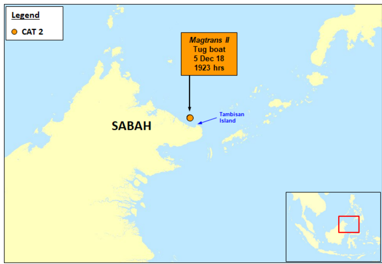
Location of incident

During 25-31 Dec 18, one incident of armed robbery against ship was reported to ReCAAP ISC. The location of the incident is shown in the map below; and detailed description of the incident is tabulated in attachment.