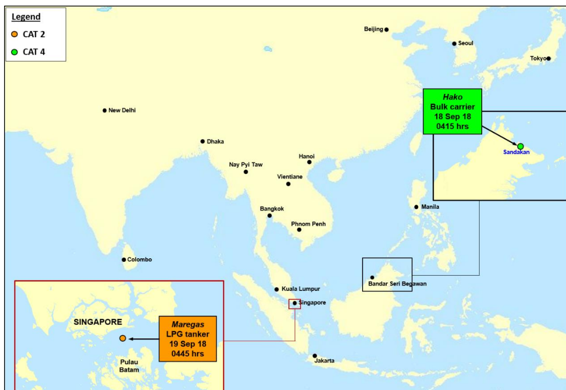
Location of incidents

During 18-24 Sep 18, two incidents of armed robbery against ships in Asia were reported to ReCAAP ISC. The location of the incidents is shown in the map below; and detailed description of the incidents is tabulated in attachment.