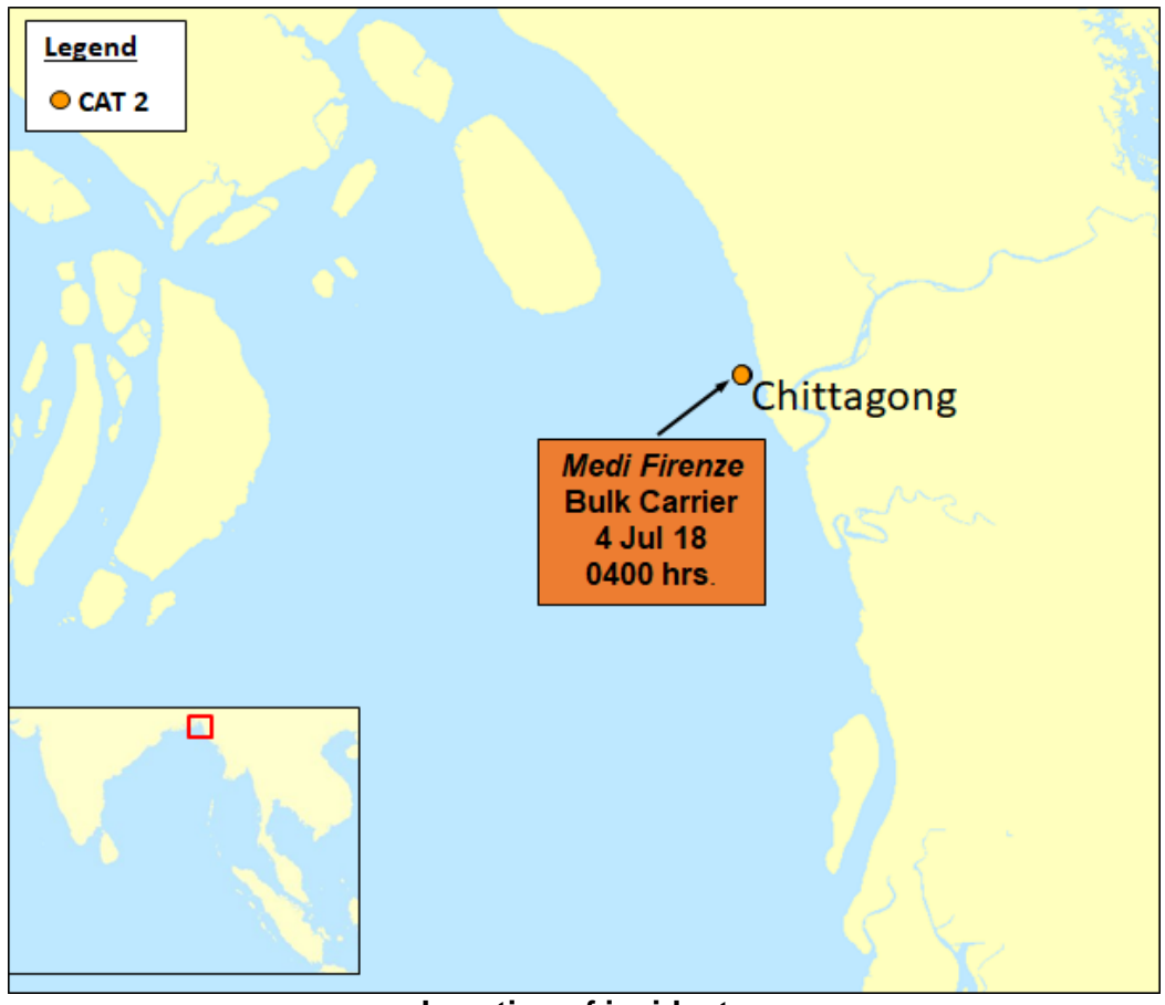
Location of incident

During 17-23 Jul 18, one incident of armed robbery against ships was reported to the ReCAAP ISC by Focal Point (Japan) and Contact Point (Hong Kong). The location of the incident is shown in the map below; and detailed description of the incident is tabulated in attachment.