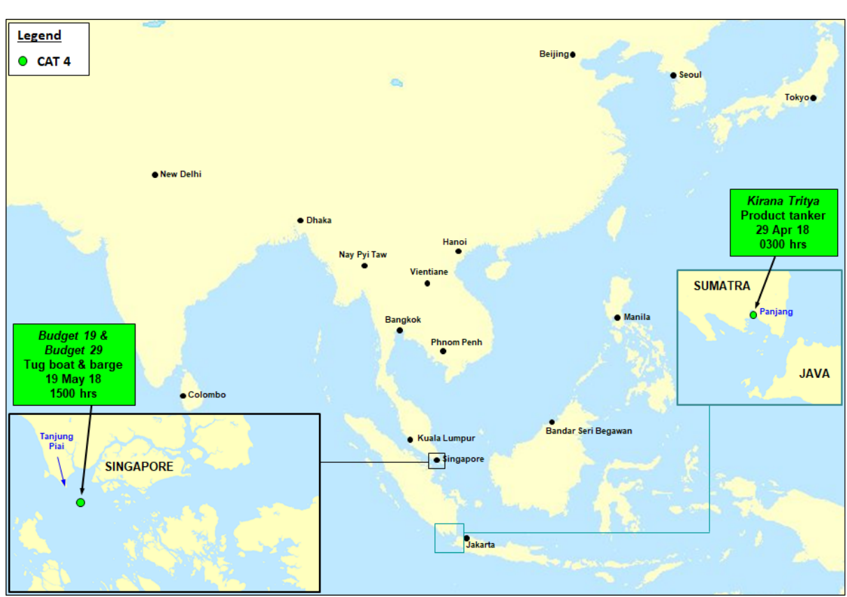
Locations of incident

During the period of 15-21 May 18, two incidents of armed robbery against ships were reported to the ReCAAP ISC. The location of the incidents is shown in the map below; and detailed description tabulated in attachment.