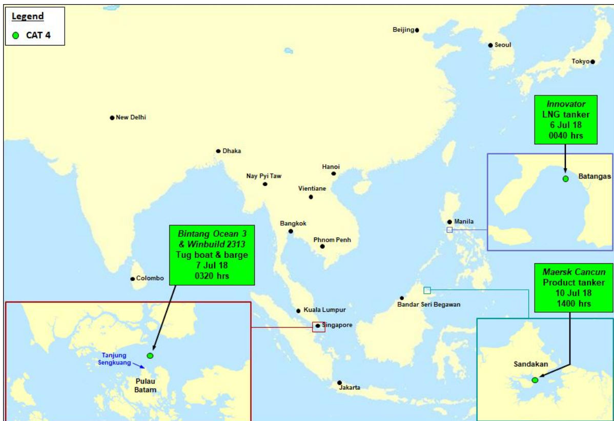
Location of incidents

During 10-16 Jul 18, three incidents of armed robbery against ships were reported to the ReCAAP ISC. The location of the incidents is shown in the map below; and detailed description of the incidents is tabulated in attachment.