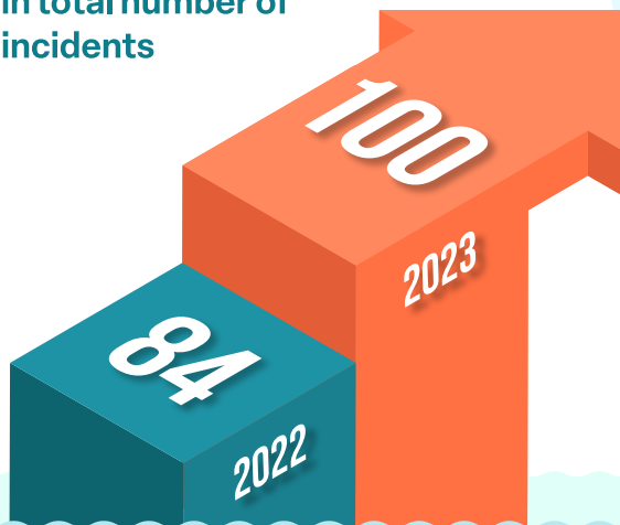
Number of incidents (2019-2023)