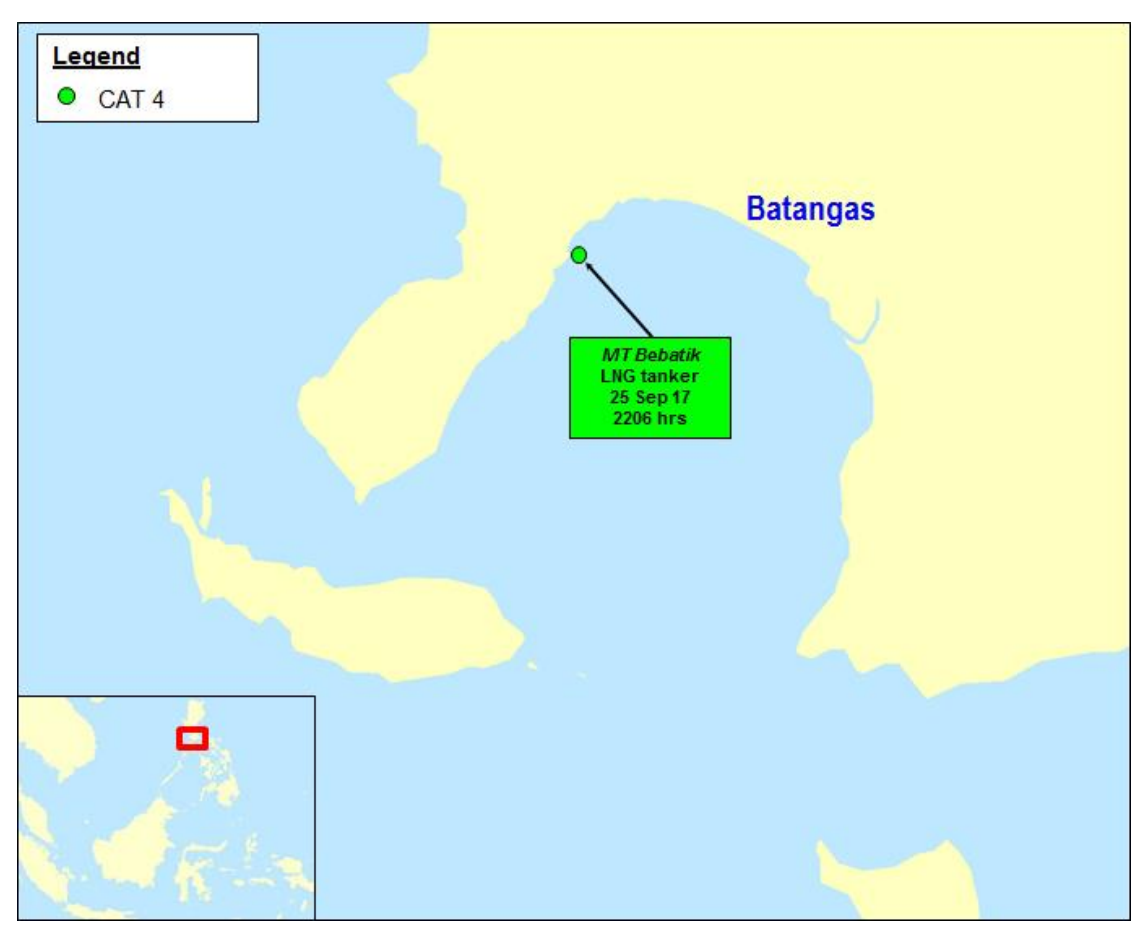
Location of incident

For the period of 26 Sep-2 Oct 17, <u>one</u> incident of armed robbery against ship was reported to the ReCAAP ISC. The location of the incident is shown in the map below; and detailed description tabulated in attachment.