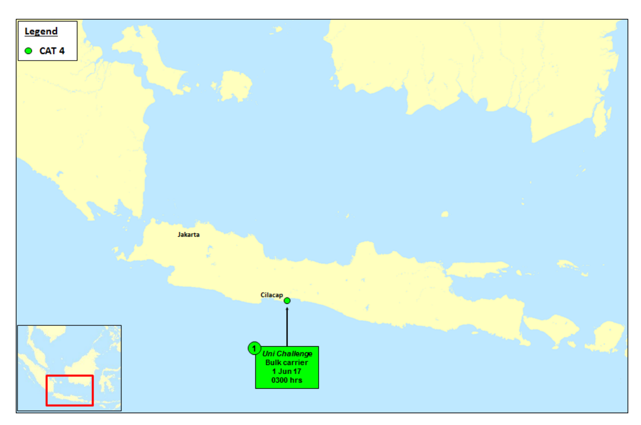
Location of incident

During 30 May - 5 June 17, one incident of armed robbery against ships in Asia was reported to the ReCAAP ISC. The location of the incident is shown in map below; and detailed description tabulated in attachment.