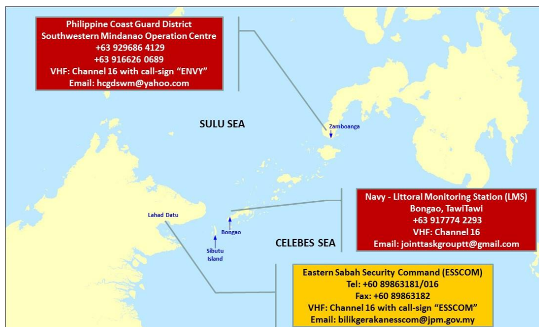
Contact details of the centres

The ReCAAP ISC reiterates its advisory issued via the ReCAAP ISC Incident Alert dated 21 November 2016 to all ships to re-route from the area, where possible. Otherwise, ship masters and crew are strongly urged to exercise extra vigilance while transiting the Sulu-Celebes Sea and eastern Sabah region, and report immediately to the following Centres: