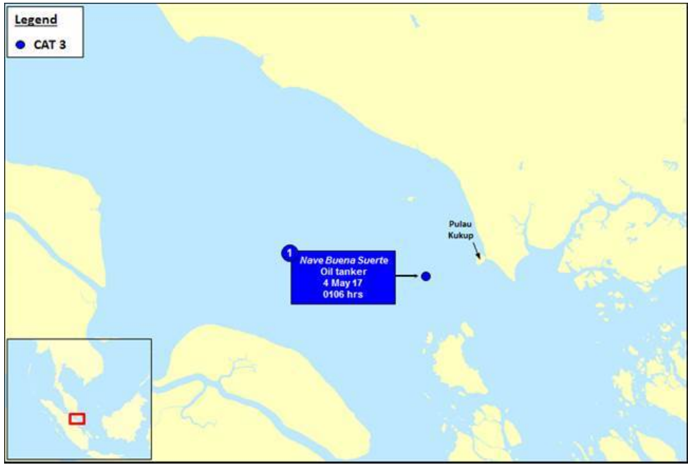
Location of incident

During 9-15 May 17, one incident of armed robbery against ships in Asia was reported to the ReCAAP ISC. The location of the incident is shown in map below; and detailed description tabulated in attachment.