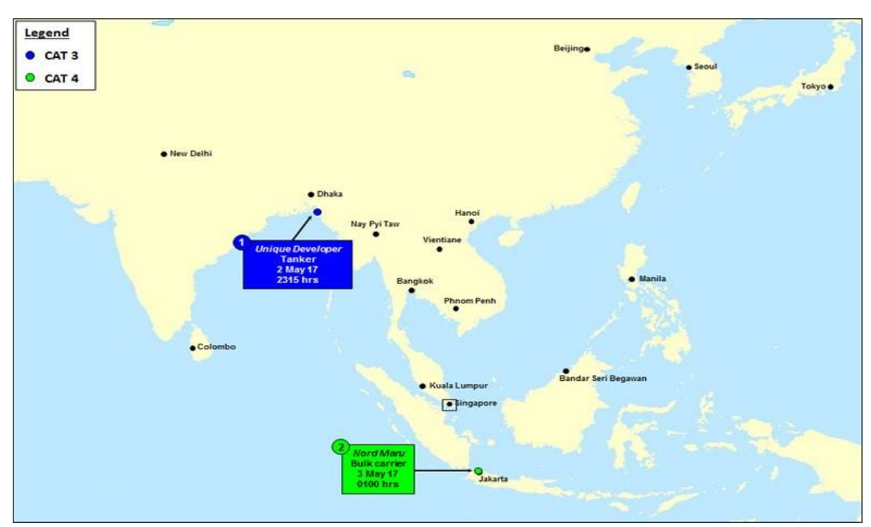
Location of incidents (2-8 May 17)

During 2-8 May 17, two incidents of armed robbery against ships in Asia were reported to the ReCAAP ISC. The locations of the two incidents are shown in map below; and detailed descriptions tabulated in attachment.