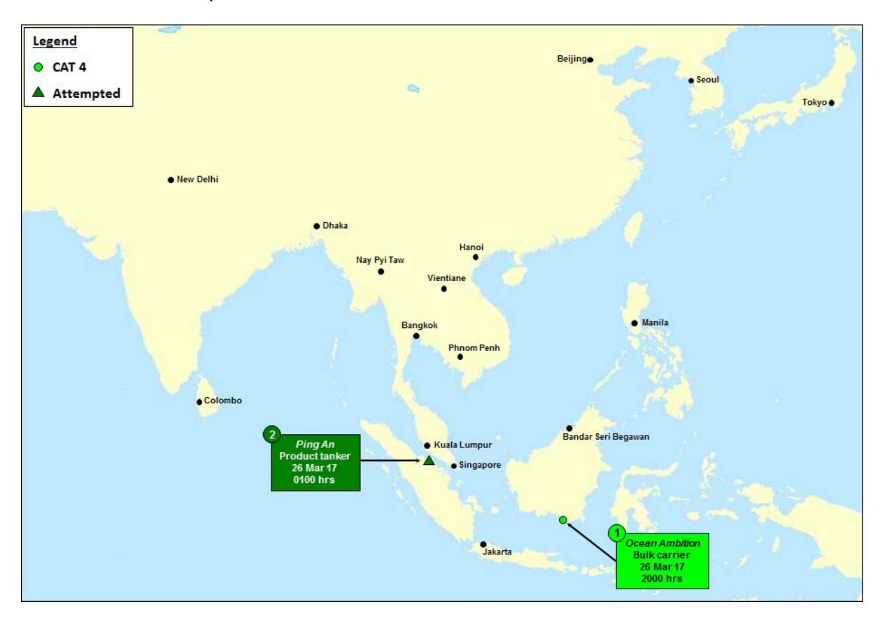
Location of incidents

For the period of 4-10 Apr 17, two incidents of armed robbery against ship were reported to the ReCAAP ISC. The location of the incidents is shown in the map below; and detailed descriptions tabulated in attachment.