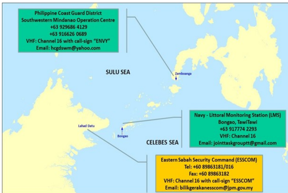
Contact details of the Centres

The ReCAAP ISC reiterates its advisory issued via the ReCAAP ISC Incident Alert dated 21 November 2016 to all ships to re-route from the area, where possible. Otherwise, ship masters and crew are strongly urged to exercise extra vigilance while transiting the Sulu-Celebes Sea and off eastern Sabah region; and report immediately to the following Centres: