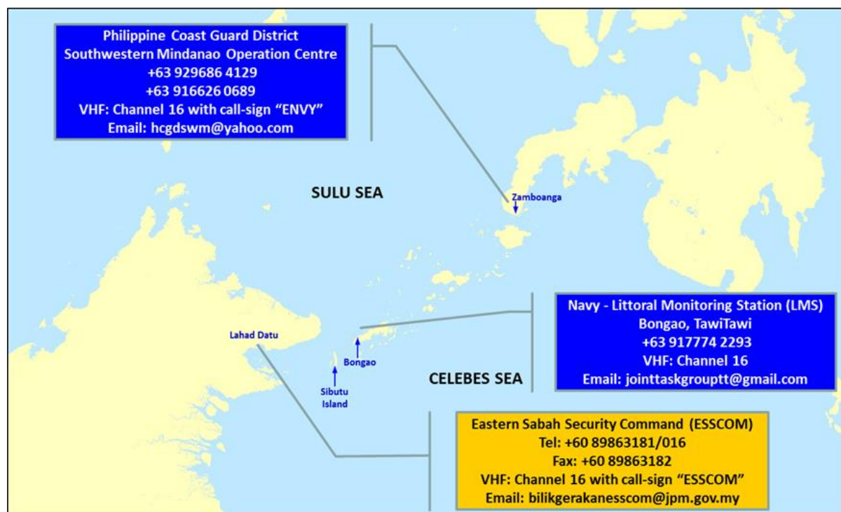
Contact details of the reporting centres

The ReCAAP ISC reiterates its advisory issued via the ReCAAP ISC Incident Alert dated 21 November 2016 to all ships to re-route from the area, where possible. Otherwise, ship masters and crew are strongly urged to exercise extra vigilance while transiting the Sulu-Celebes Sea and eastern Sabah region, and report immediately to the following Centres: