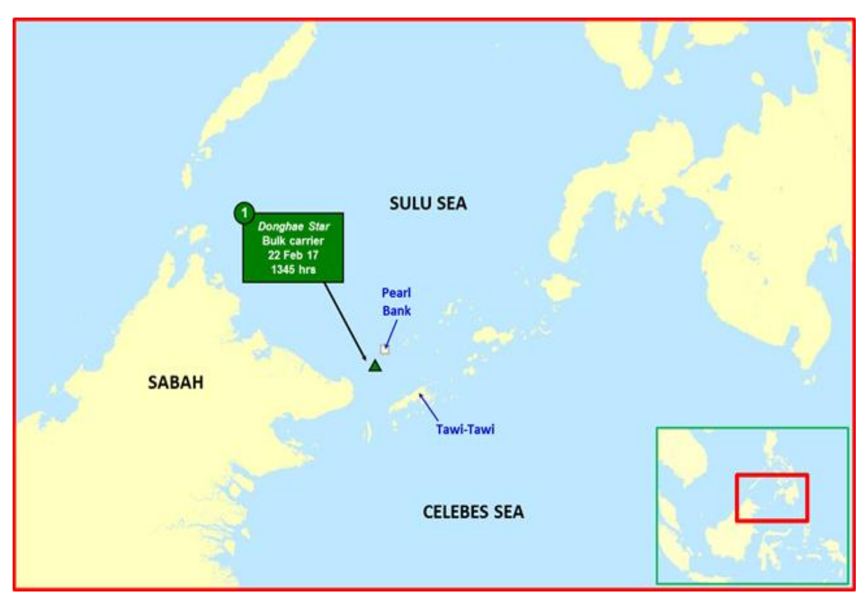
Location of incident (21 – 27 Feb 17)

For the period of 21-27 Feb 17, <u>one</u> attempted incident of abduction of crew from a bulk carrier while underway in the Sulu-Celebes Sea was reported to the ReCAAP ISC. The location of the incident is shown in the map below; and detailed description tabulated in attachment.