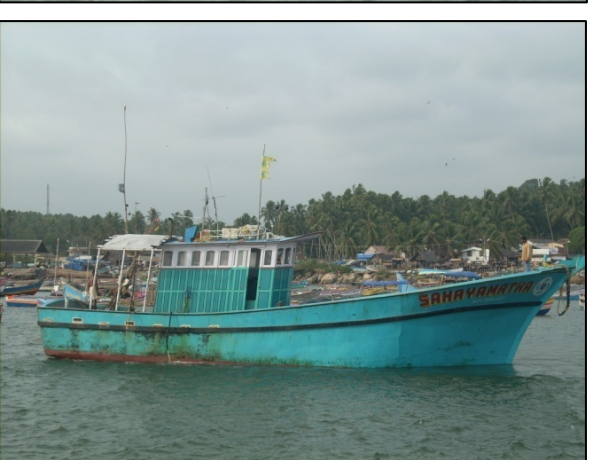
Type of fishing boats