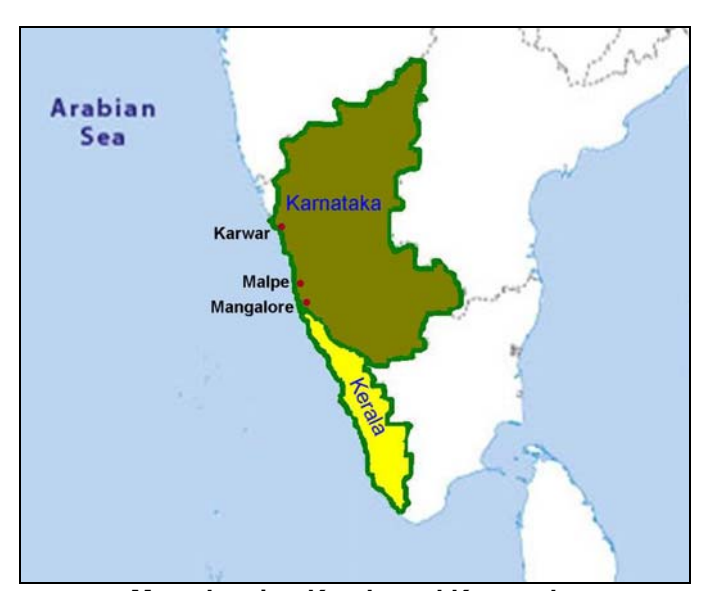
Map showing Kerala and Karnataka

1. The southwest coast of India has been a popular fishing zone where fishing seasons are subjected to two monsoons, namely the southwest monsoon and the northeast monsoon. The southwest monsoon coincides with the period of upwelling and phytoplankton bloom which results in large number of fishes and crustaceans in the area. The two largest fishing states located off the southwest coast of India are Kerala and Karnataka (see map below). Annex A provides the geographical description of the two fishing states.