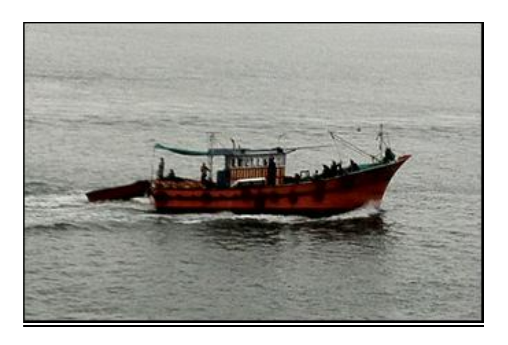
Photograph of 'chase boat' towed by a fishing vessel

7. Fishing by mechanised fishing vessels is either by trawling, or ring seiners off the Kerala coast and pre-dominantly purseining off the Karnataka coast. The purseine boats which had been confused as 'chase boats' by merchant vessels, usually towed a small boat used to lay nets. The ringseiners are mechanised boats which lay large nets up to nearly 2 km for an extended duration, would remain stationery and take several hours to recover manually. These boats operate up to 30-40 nm off the coast of Kerala. See photograph below.