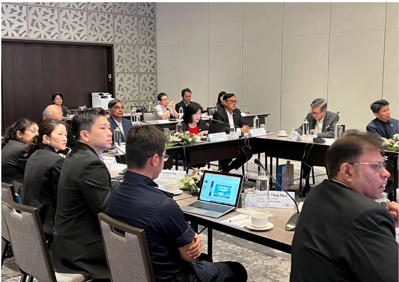
Caption: A Dialogue Session with representatives from the Shipping industry as well as MPA, RSN IFC and PCG to combat piracy and armed robbery against ships in Asia.