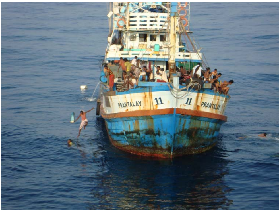
Pirates and crew jumping off Prantalay 11 for recovery