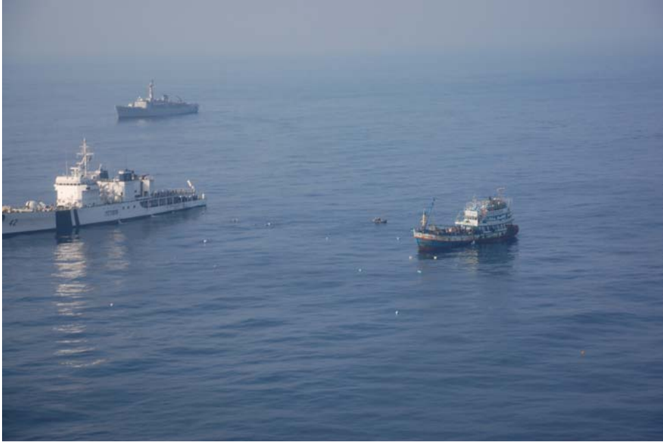
Prantalay 11 stopped by Indian Law Enforcement Agencies