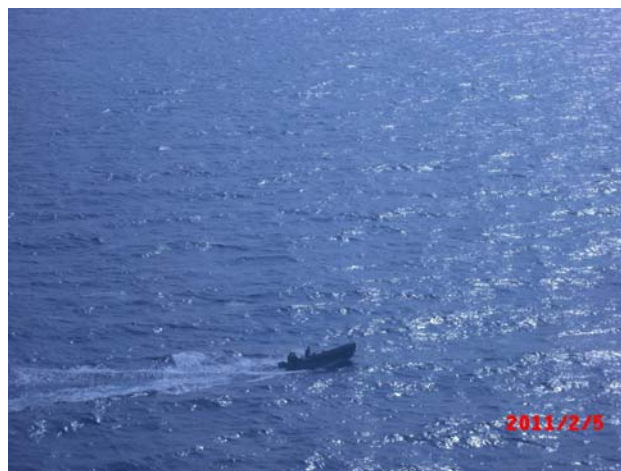
The skiff trying to approach MT Chios