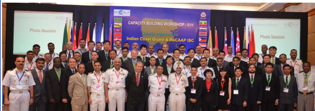
Capacity Building Workshop 5/11 15-17 November 2011, JW Marriott Hotel, Goa, India

OTHER than operational-level Officers from Focal Points and other relevant agencies, participants also included representatives from International Maritime Organization (IMO), Indonesian Maritime Security Coordinating Board (BAKORKAMLA), Malaysian Maritime Enforcement Agency (MMEA), and Indian National Shipping Association (INSA). For the second time, representatives of Djibouti Code of Conduct Information Sharing Centres (DCoC ISCs) located in Dar es Salaam (Tanzania) and Mombassa (Kenya) were observers at CBW 5/11.