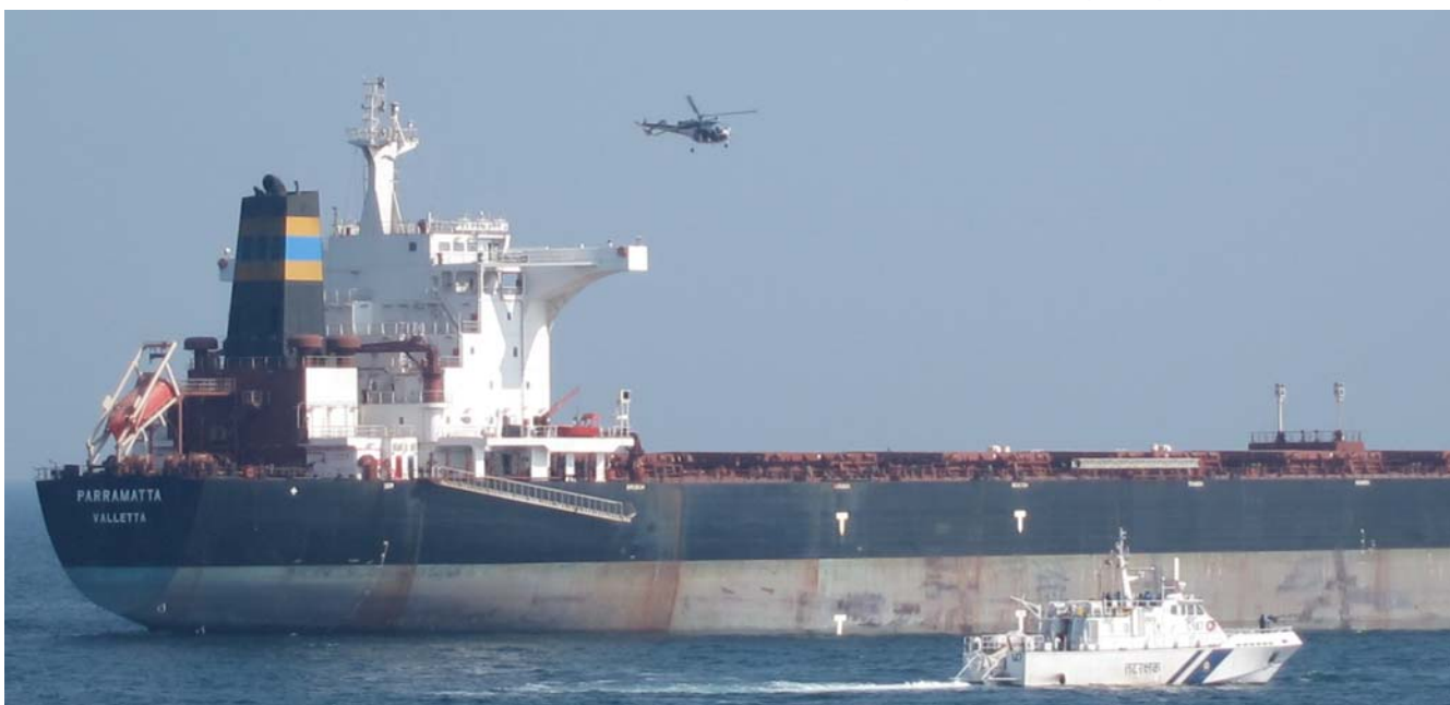
Anti-piracy demonstration involving ICG's two advance offshore patrol vessels, one helicopter and a commercial vessel