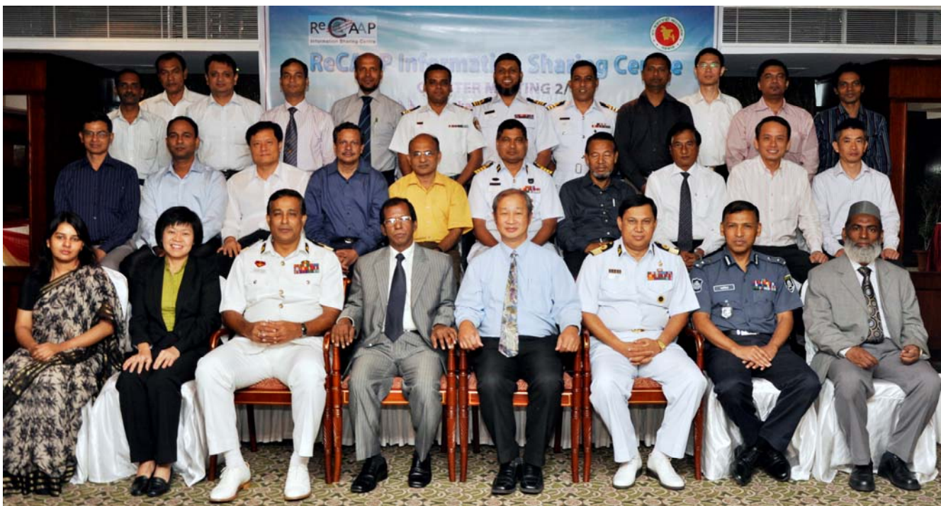
Gathering of Focal Points—Bangladesh, India, Myanmar and Sri Lanka, ReCAAP ISC, and other relevant Bangladesh government agencies in Dhaka, Bangladesh

RECIPROCATE the good efforts, shipping companies at the Port of Chittagong shared their views on seafarers' challenges and proposed more avenues for information exchange processes.