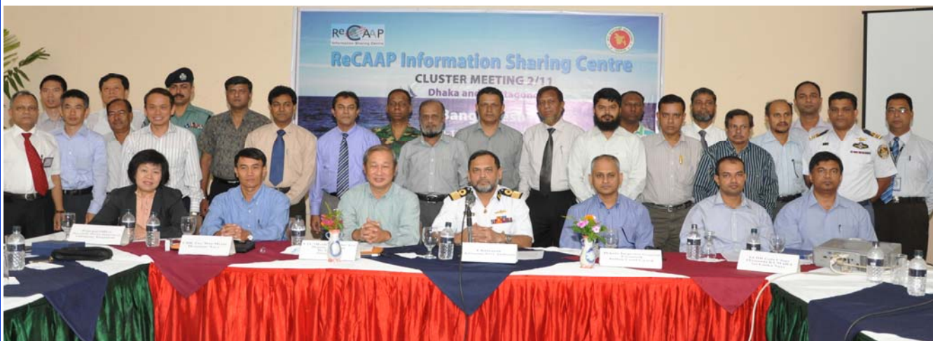
Meeting with Bangladesh Shipping Association and shipping companies in Chittagong, Bangladesh