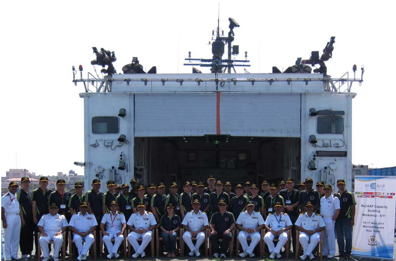
Participants on board ICG's advanced offshore patrol vessel Sankalp at the anti-piracy demonstration

THE grand finale was an anti-piracy demonstration at sea by Indian Coast Guard (ICG). Two ICG ships, an Interceptor boat, a fixed wing aircraft and a helicopter participated in the coordinated responses to assist in the rescue mission. The boarding teams were also launched by both the ICG vessels. During the exercise the participant also witnessed the firefighting demonstration by the ships at sea. The short demonstration provided the participants an overview of the capabilities of the ICG in combating and suppression of piracy and armed robbery against ship at sea.