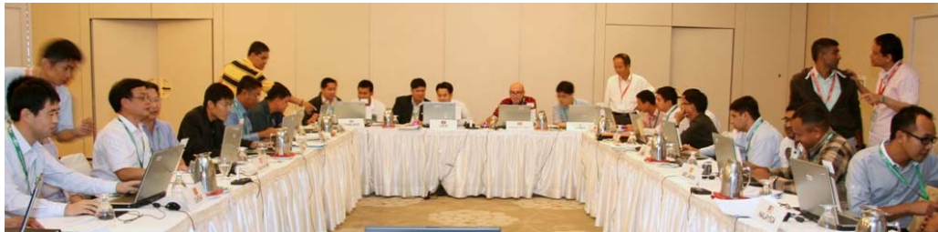
Participants at 'work' in a multi-agencies' information network environment to combat multi-national and cross territorial boundaries maritime incidents. Collaborative efforts came alive over IFN and across the meeting room, knowing no single agency has the total resources to counter them alone.