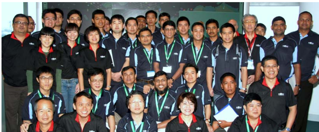
The Fourth ReCAAP ISC Capacity Building Workshop, 9-11 November 2010, Singapore Visit to Port Operations Control Centre 2, MPA

The workshop was concluded with a visit to the Port Operations Control Centre 2 (POCC2) for a briefing hosted by MPA, and NYK Ship Management to view the advanced training facilities.