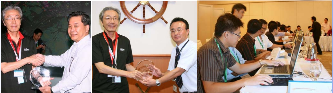
(From Left) PIC 1: Visit to POC2 of MPA, PIC 2: NYK Ship Management, and PIC 3: Participants warming up for the Conduct of Table Top Scenario Based Exercise